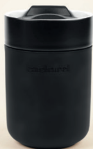
Alix isothermal flask black CAI334A