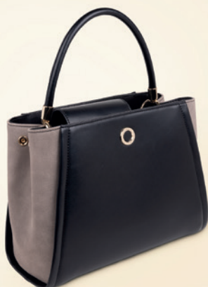
Alix lady bag black CTX334A