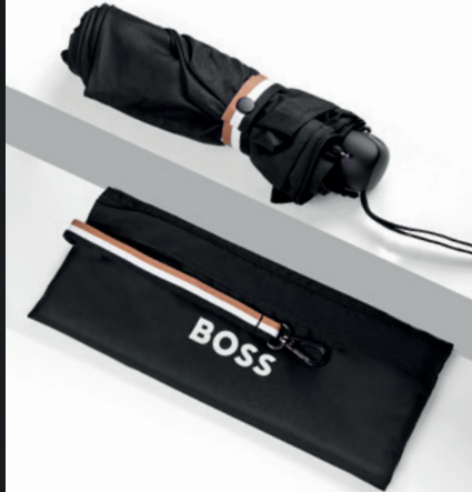
Iconic umbrella mini black HUG321A