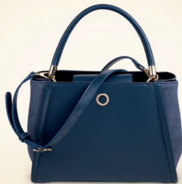
Alix lady bag navy CTX334N