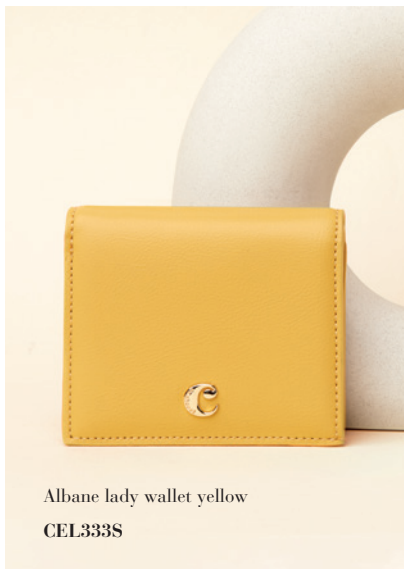
Albane lady wallet yellow CEL333S