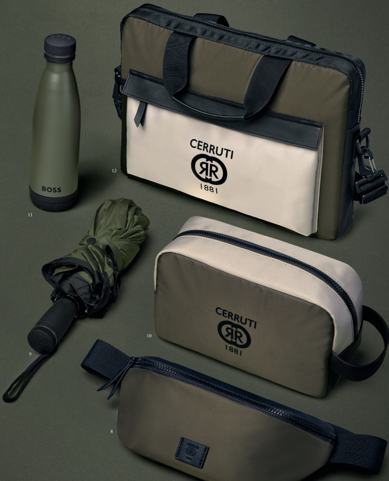
1. Gear Matrix ballpoint pen khaki - HUGO BOSS - HSC9744T