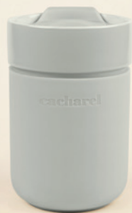
Alix isothermal flask grey CAI334K