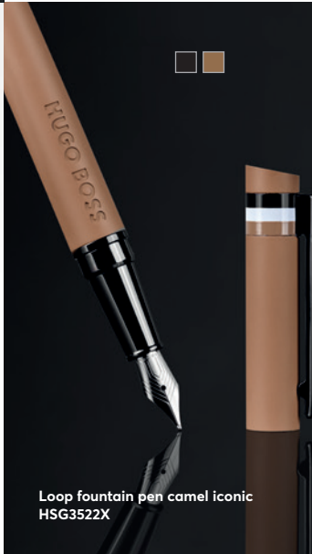
Loop fountain pen camel iconic HSG3522X