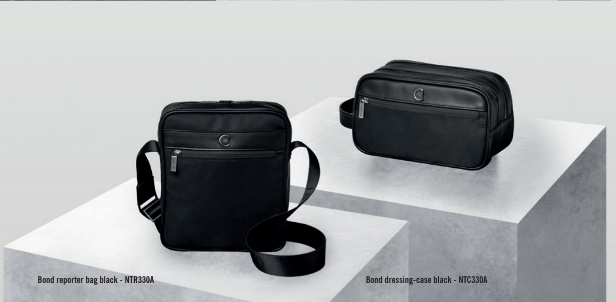
Bond reporter bag black - NTR330A