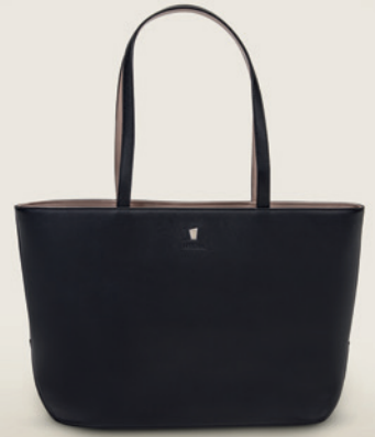
Mademoiselle lady bag black FTX322A