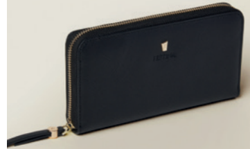
Mademoiselle travel wallet black FEL222A