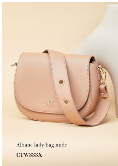
Albane lady bag nude CTW333X