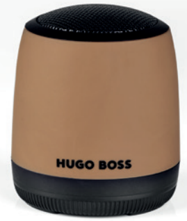
Gear speaker camel HAE007X