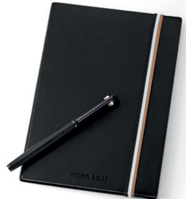
Set Iconic notebook A5 & Loop rollerball pen HPHR352A