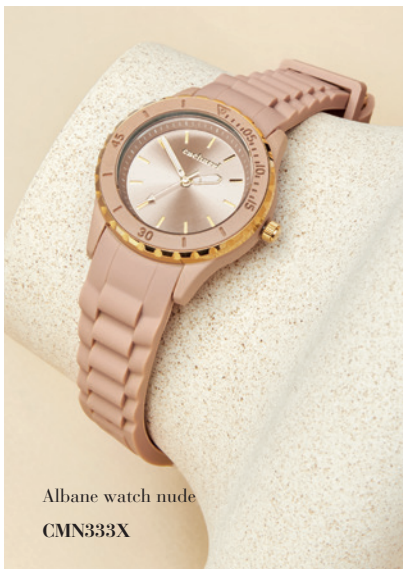
Albane watch nude CMN333X