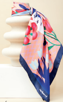
Alix scarf navy CFM334N