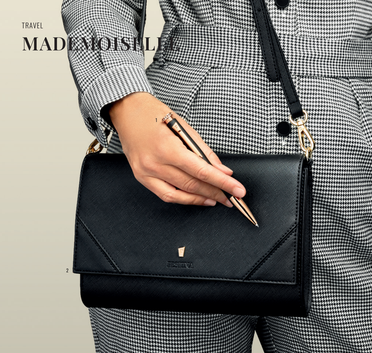
1. Mademoiselle ballpoint pen black - FSC2224A