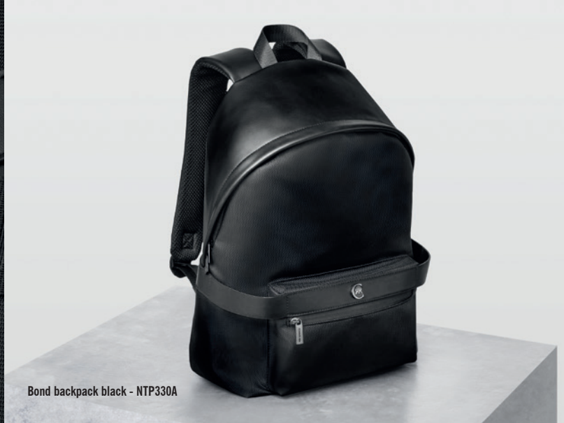
Bond backpack black - NTP330A