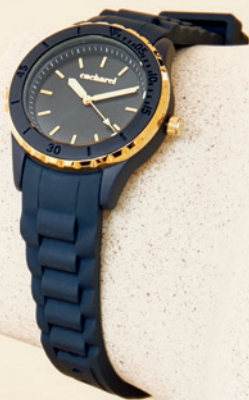
Albane watch navy CMN333N