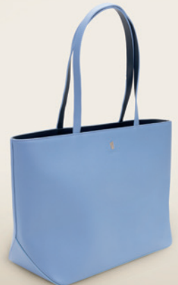
Mademoiselle lady bag light blue FTX322M