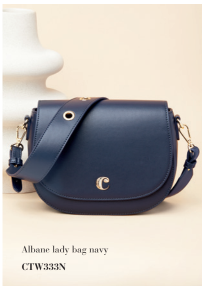
Albane lady bag navy CTW333N