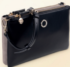
Alix lady bag black CTW334A