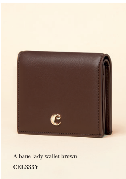
Albane lady wallet brown CEL333Y