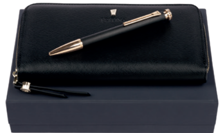
Set Mademoiselle travel wallet & Mademoiselle ballpoint pen - FPBL222A

Tote & crossbody bags for ladies are added this year to the already iconic “Mademoiselle” Festina collection. Made of beautiful, saffiano textured, vegan leather all products feature a golden F signature plate, and contrasted interiors as a guiding thread throughout the line.