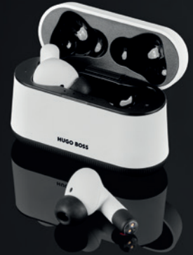
Gear Matrix earphones white-s HAP107W-S