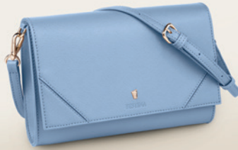
Mademoiselle lady bag light blue FTW322M