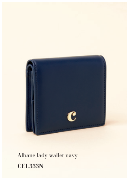
Albane lady wallet navy CEL333N