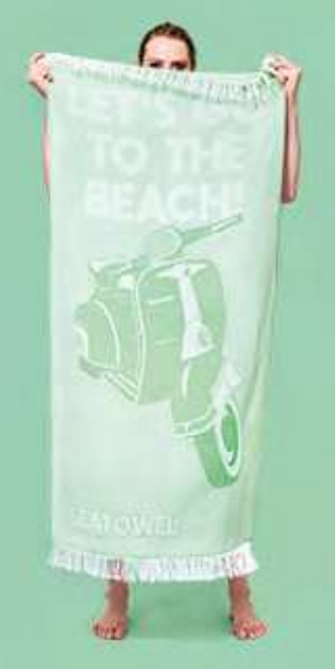
MEDIUM 70 x 140 cm