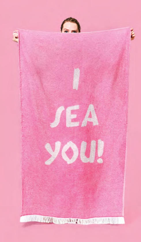
XL 200 x 100 cm