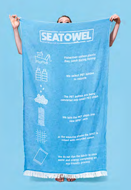
LARGE 170 x 100 cm